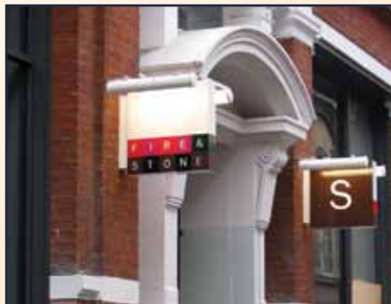
FIRE & STONE