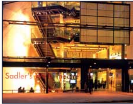
SADLER'S WELLS THEATRE