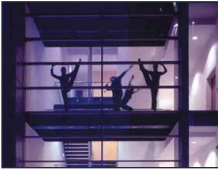
THE PLACE DANCE SCHOOL